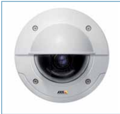
AXIS P3363-VE, AXIS P3364-VE Weight: 1.5 kg (3.3 lb.) with weather shield